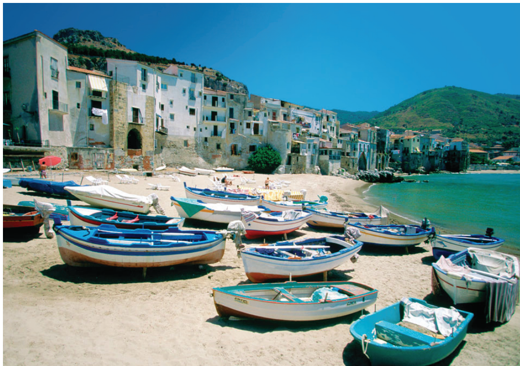
Colorful fishing boats along a Sicilian harbor

Day 6: Taormina/Matera We leave Sicily today for the mainland region of Basilicata, a day-long transfer that includes a ferry ride from Sicily to Calabria. Late this afternoon we reach Matera, whose historic troglodyte churches and dwellings ( Sassi ) have been designated a UNESCO site and where our hotel is a renovated cave dwelling in the city's historic district. B,D