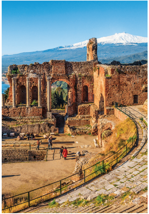
Taormina's ancient theater overlooks Mt. Etna.

Day 11: Taormina This morning we embark on a walking tour of this delightful medieval town set on a rocky terrace overlooking the Ionian Sea. Highlights include the 3 rd -century BCE Greek theatre, where gladiators once battled; the 13 th -century fortress-like Duomo ; and grand Piazza Vittorio Emanuele, site of