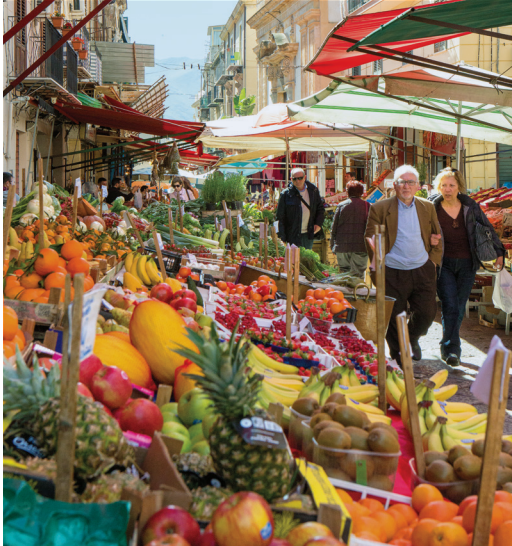
Colorful Sicilian street scene

the ancient agora and today an inviting plaza. This afternoon is at leisure to enjoy Taormina as we wish; tonight we celebrate our Sicily adventure over a fare-well dinner at our hotel. B,D