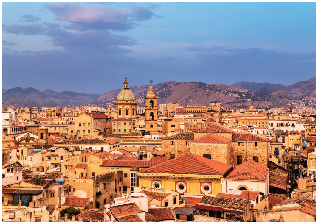
The sun rises over the city of Palermo.

in existence. The imposing main façade and ornate outer cloister serve to prepare us for the cathedral's breathtaking main sanctuary, where every inch of wall and ceiling space is covered with painstakingly detailed mosaics. Crafted by artisans from Constantinople (now Istanbul), the dazzling mosaics contain some 4,850 pounds of pure gold. Our journey then continues as we visit a family-owned winery, followed by a wine tasting and lunch at a nearby country house. Late this afternoon we reach Agrigento and our hotel, where we dine together tonight. B,L,D