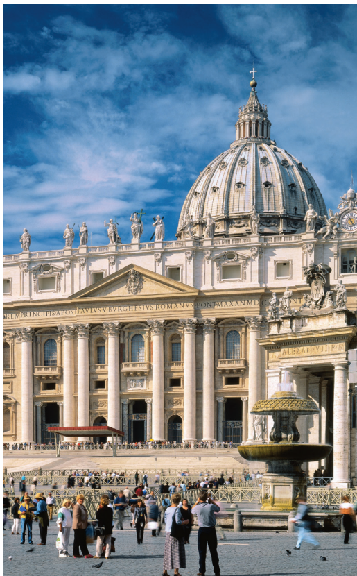
We visit St. Peter's Square and Basilica on Day 7.