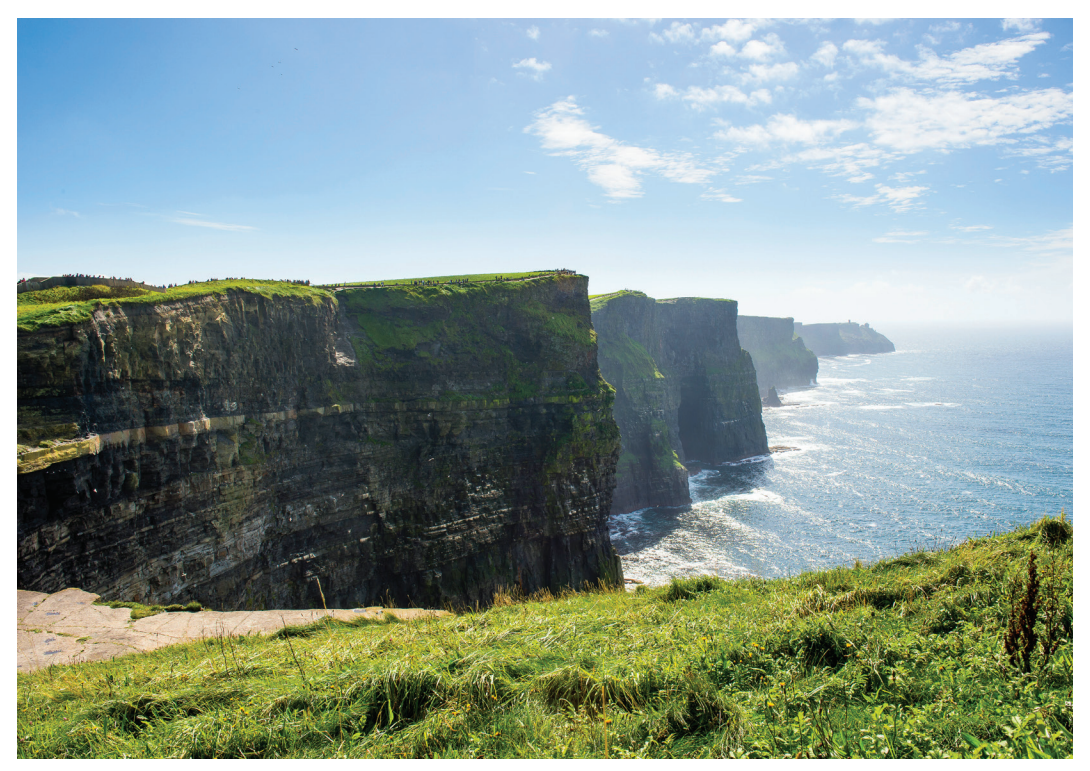
The sun shines down on the Cliffs of Moher, as we see on Day 7.

here, imparting local lore along the way. We stop at Dun Aenghus Fortress, the three prehistoric stone walls crowning the tallest cliffs of Inishmore; have lunch in a local pub; and enjoy some free time before returning to the mainland and our hotel late this afternoon. Dinner tonight is at a local restaurant in the village of Bearna. B , L , D