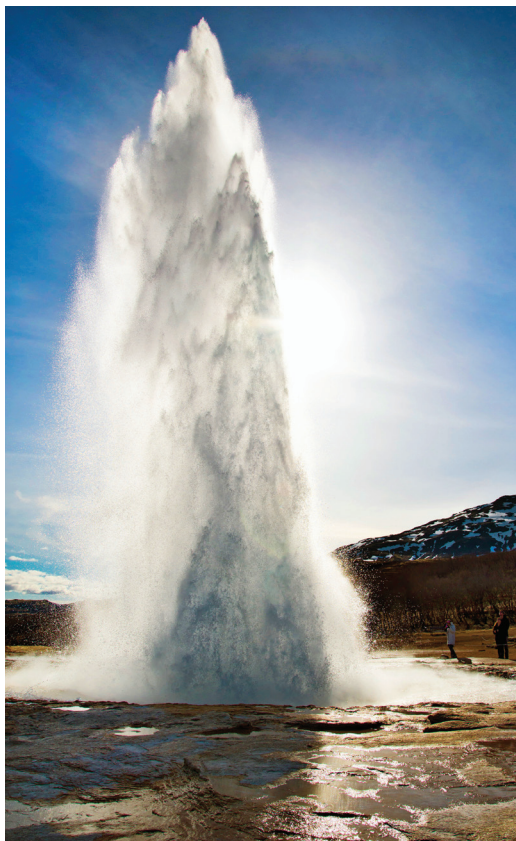
Iceland's hot spring geysers are famous natural attractions.

Day 11: Depart for U.S. Today we depart for the airport and our return flights to the U.S. B