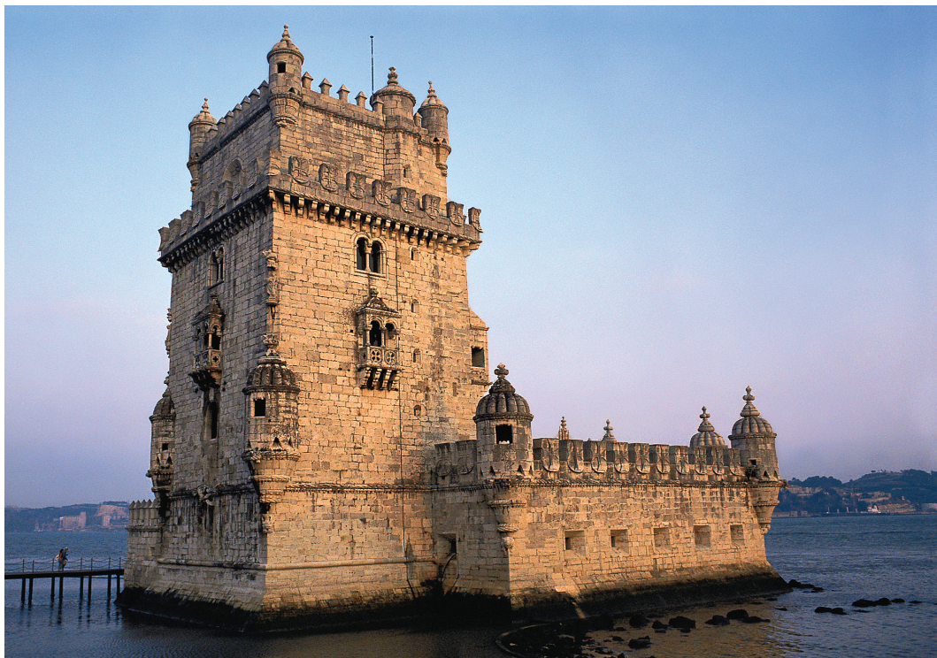
We see iconic Belém Tower, the most photographed monument in Portugal, on Day 3.

Day 7: Carmona/Seville This morning we visit splendid Seville, Moorish capital of Spain's Andalusia region and city of beauty and romance. This is the place that inspired Carmen and Don Giovanni ; where fragrant orange trees and flower-bedecked balconies delight the senses; and home of the renowned Catédral, the world's largest Gothic building. After a tour that includes the Alcazar palace and the Arab quarter, the afternoon is free to explore independently. We return to Carmona late afternoon and dine at our parador this evening. B,D