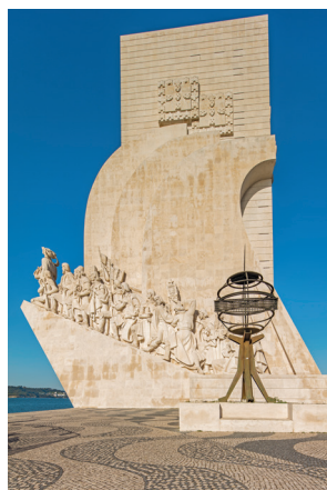
Lisbon's Monument to the Discoveries

Day 13: Madrid Our morning tour of this monumental and dignified capital city includes vast Plaza Mayor; the Moorish medieval district; and opulent