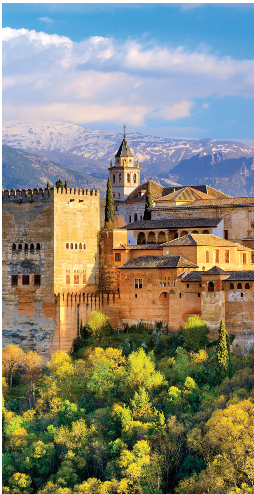
We tour the Alhambra on Day 11.