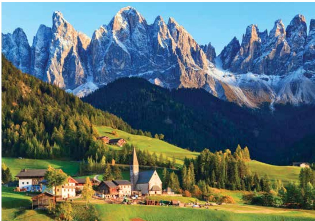
We enjoy stunning Dolomites scenery in the South Tyrol.

Day 7: Santa Margherita/Cinque Terre/Portovenere We depart this morning by train for the Cinque Terre (literally, “Five Lands”), the five cliff-clinging villages seemingly carved from the mountains. Originally medieval fishing villages, the Cinque Terre were inaccessible by land for centuries. We stop in scenic Vernazza and board a boat for a comfortable cruise along the rugged coastline to visit another village of the Cinque Terre. From here we cruise to the port town of Portovenere, with its cluster of colorful column-shaped houses. After a brief walking tour of the Old Town, we have time to explore and enjoy lunch on our own. We dine together tonight at our hotel. B,D