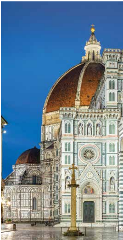
Florence’s Duomo and Baptistry