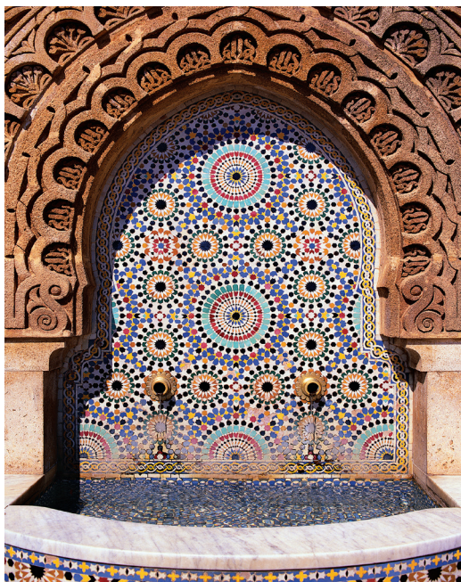
Traditional Moroccan tile work

Day 10: Ouarzazate/Ait ben-Haddou/Marrakech En route to Marrakech today, we stop first at uninhabited Ait ben-Haddou, a UNESCO World Heritage site and one of southern Morocco’s most scenic villages that is often used as a location for fashion and film shoots. Its old section consists of deep red kasbahs