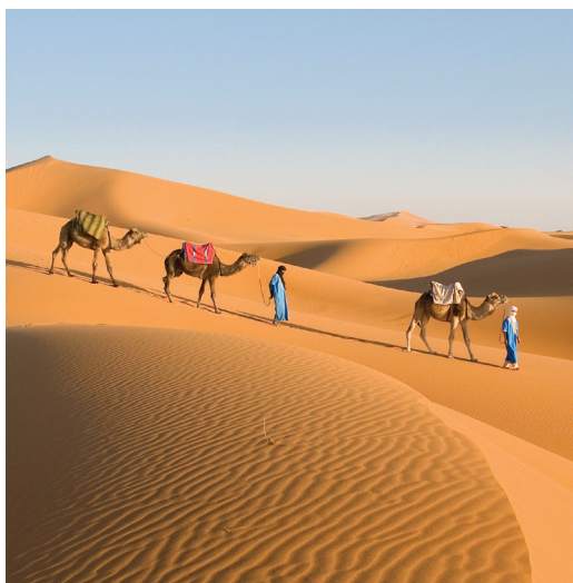
We ride camels in the Sahara.

Day 12: Marrakech This morning we travel by horse-drawn carriage from Menara Park to Majorelle Gardens, a private botanical garden known for its cobalt blue accents. Following a tour of the gardens we visit the nearby Yves St. Laurent Museum. The afternoon is