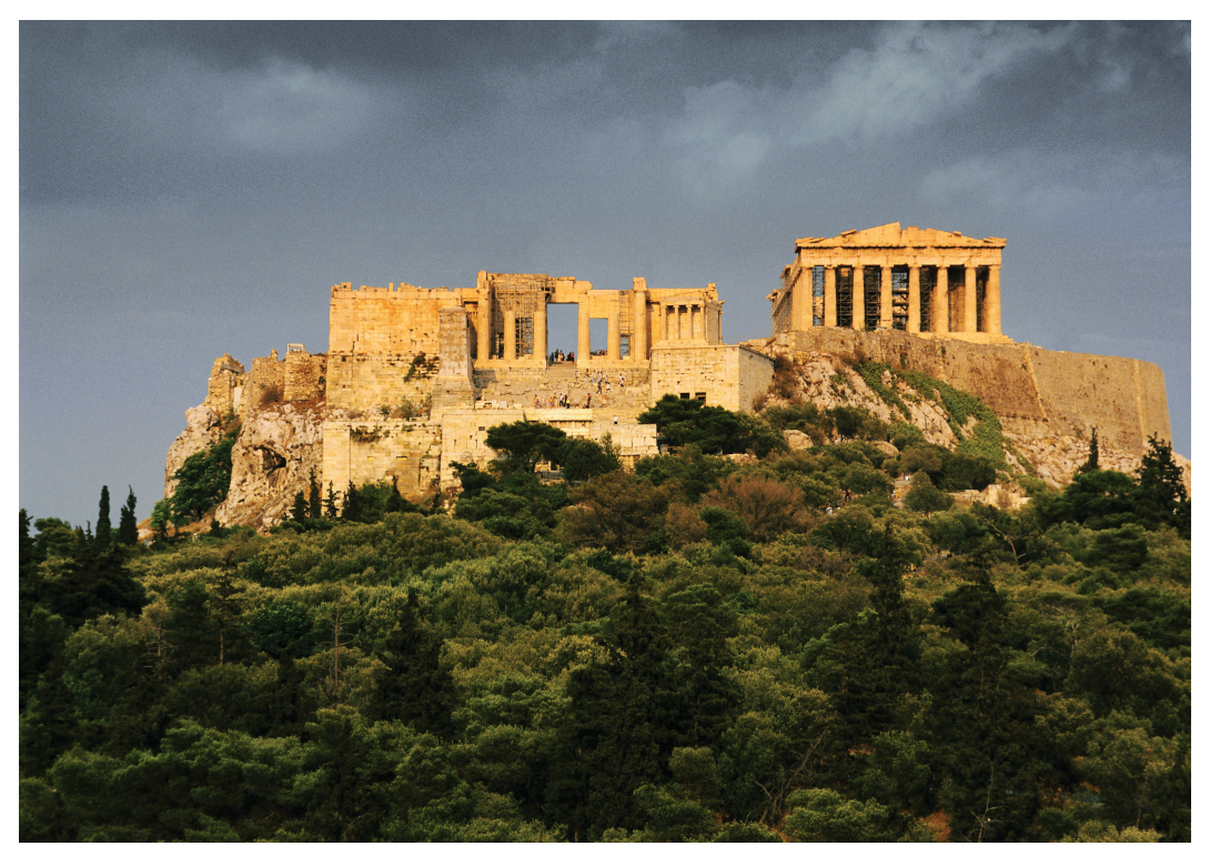
Athens' famed Acropolis and its Parthenon, which we visit on Day 3

Day 6: Epidaurus/Mycenae/Nafplion Among the highlights of this morning's visit to the vast archaeological site and museum of Epidaurus: the 2,300-year-old theater, a masterpiece of Greek architecture known for its perfect acoustics and still in use today. Long associated with healing and medicine, Epidaurus comprises one of the most complete sanctuaries remaining from antiquity. This afternoon we tour the imposing ruins at Mycenae, a UNESCO site that represented the pinnacle of civilization from the 15th to the 12th centuries BCE. A key influence on the development of classic Greek culture (and hence Western civilization), Mycenae also is linked to Homer's epics, Iliad and The Odyssey. We see the Tomb of Agamemnon, with what was the world's highest and widest dome for more than a thousand years; and the Lion's Gate, the only known Bronze Age monumental sculpture in Greece. Then we visit nearby Nafplion, a gem of a Venetian/Byzantine town with picturesque narrow streets, fortifications, and a bounty of waterfront cafés - and where we enjoy an afternoon at leisure. Tonight we dine together at a local taverna. B,L,D