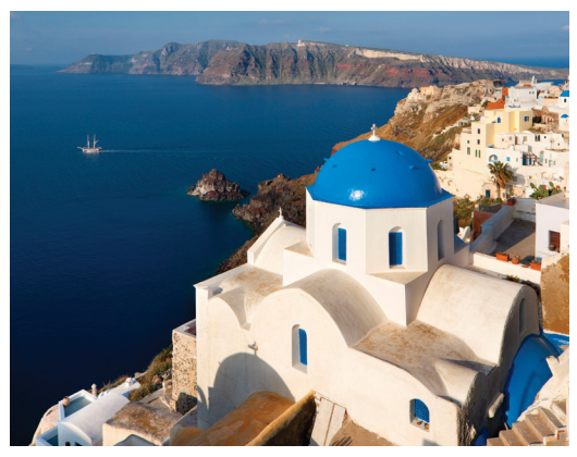
We spend two nights in idyllic Santorini.

Day 13: Santorini/Athens After a late morning flight to Athens, we check in at our hotel then have free time for lunch on our own and an afternoon at leisure, perhaps to visit the Plaka for last-minute shopping or to stroll the broad plaza of lively Syntagma Square. Tonight we enjoy a farewell dinner overlooking the Acropolis at the rooftop restaurant of our hotel. B,D