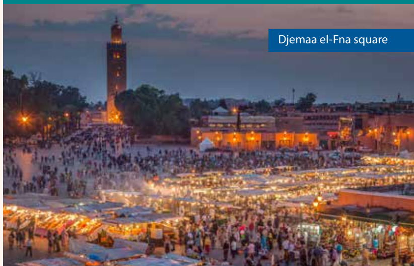
Djemaa el-Fna square