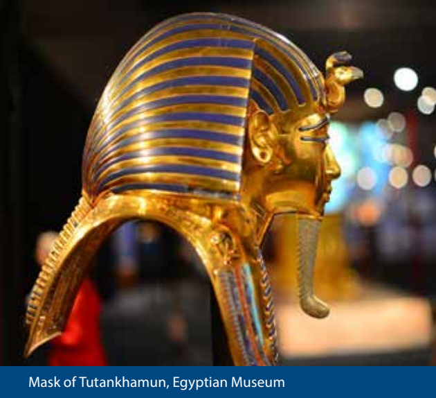
Mask of Tutankhamun, Egyptian Museum