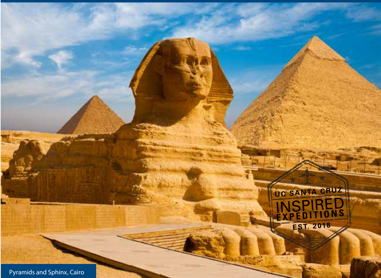
Pyramids and Sphinx, Cairo

Join us on a tour of Egypt where monumental pyramids rise out of the desert and the River Nile weaves through the land providing the country with its extraordinary history. Shifting sands and arid conditions have preserved thousands of years of a remarkable civilization in fascinating detail.