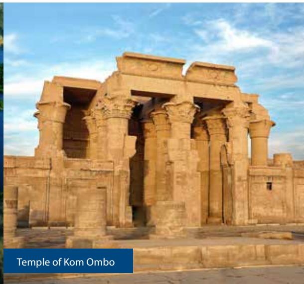
Temple of Kom Ombo