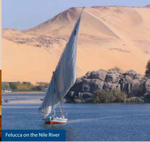
Felucca on the Nile River