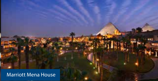
Marriott Mena House

A hotel with a storied history, dating to 1886, includes visits from heads of state and celebrities as well as 1977 peace talks between Egypt and Israel. Rooms have Pyramid views and hotel amenities include three international restaurants, a bar, spa, gym, and outside swimming pool.