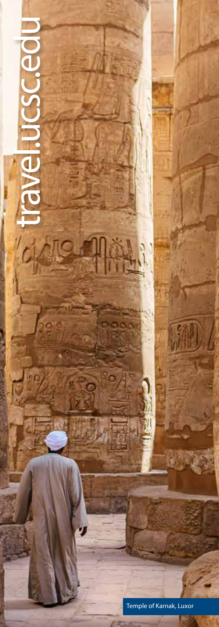
Temple of Karnak, Luxor