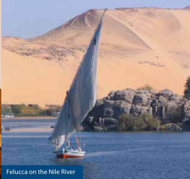
Felucca on the Nile River