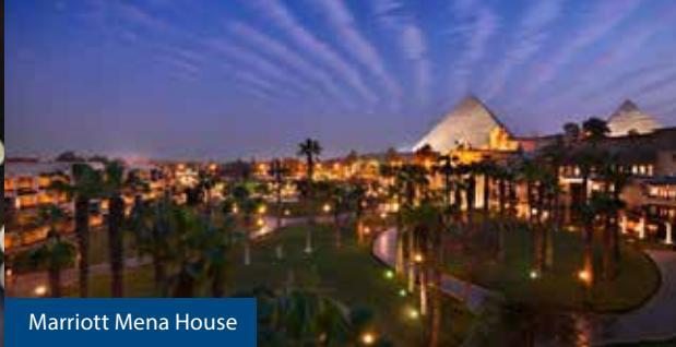
Marriott Mena House