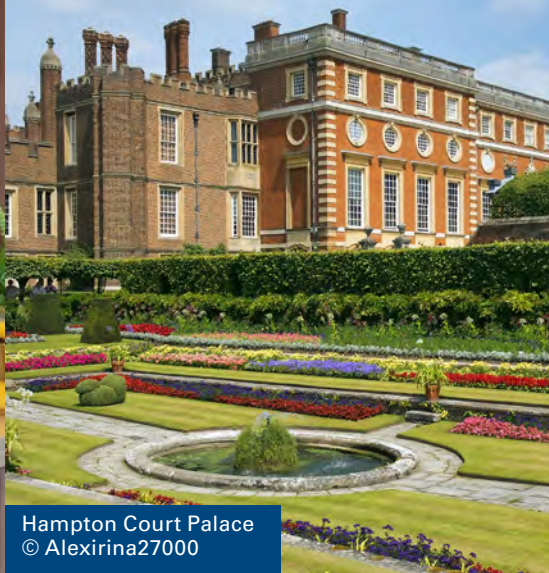
Hampton Court Palace

St. Paul's Cathedral Dr. Johnson's House & Museum Covent Garden