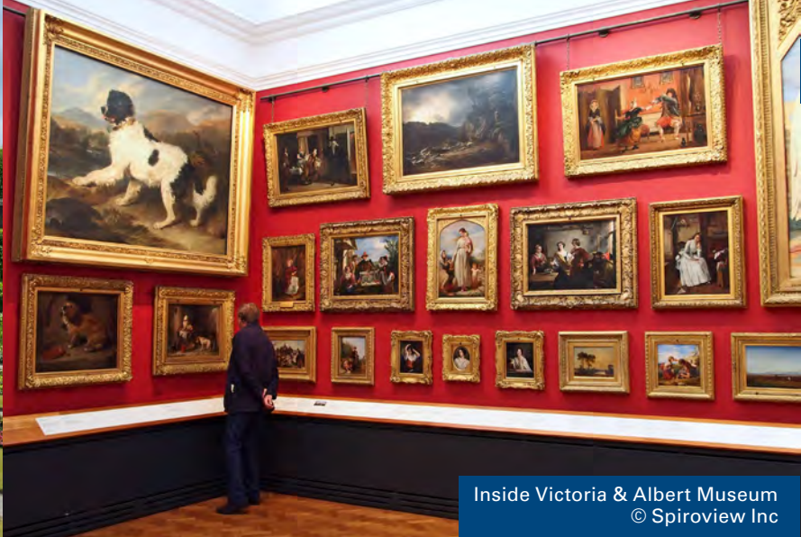
Inside Victoria & Albert Museum

Once again, use your Oyster card and head to The Wallace Collection. It is described as "the greatest picture gallery in Europe" which has been recently refurbished at a cost of £5m. Though the Wallace Collection is known for its superb 18th and 19th century French paintings and decorative art. Walk to Wigmore Hall for a lunchtime concert. Spend free time for shopping around Oxford Street, Regent Street, Piccadilly Circus, Bond Street, Jermyn Street, and Burlington Arcade. Your evening is at leisure.