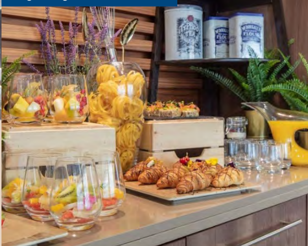
Double Tree by Hilton London Angel Kings Cross