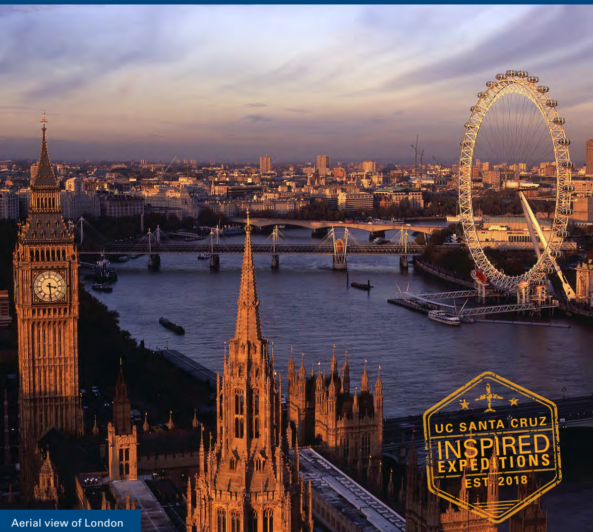
Aerial view of London