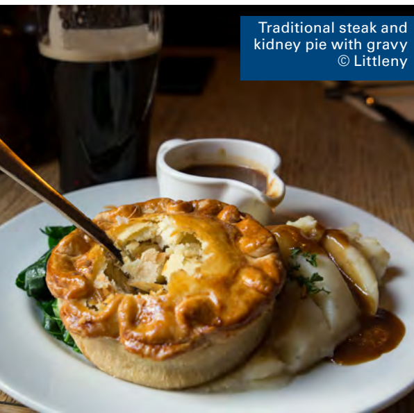
Traditional steak and kidney pie with gravy