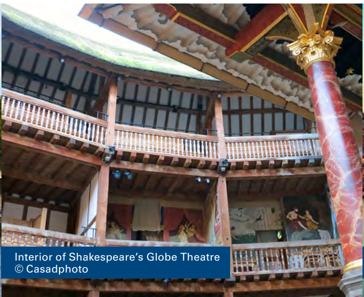
Interior of Shakespeare's Globe Theatre