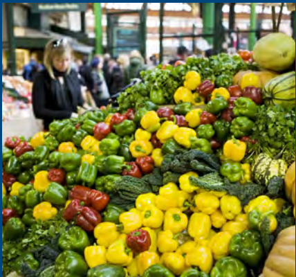
Colorful vegetables at Borough Market