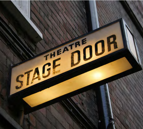
Stage door at the West End