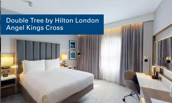
Double Tree by Hilton London Angel Kings Cross