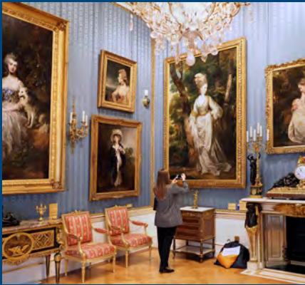
Inside the Wallace Collection