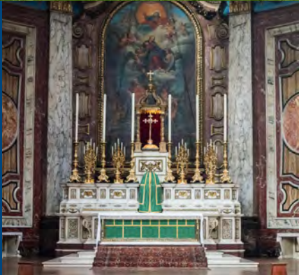
Inside the London Oratory