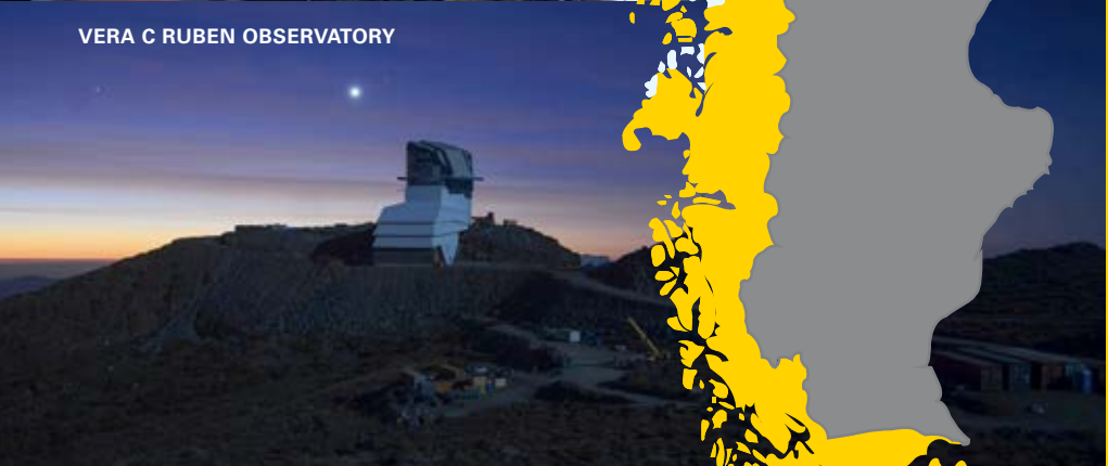
VERA C RUBEN OBSERVATORY