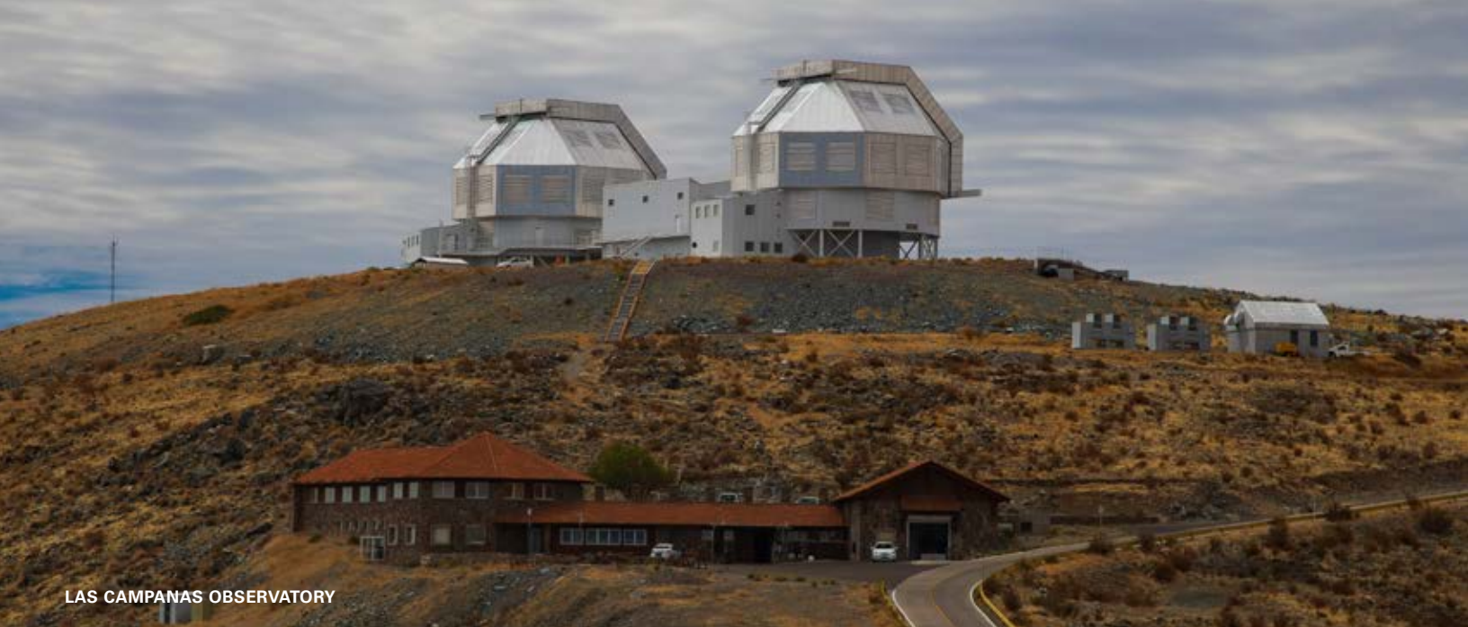
LAS CAMPANAS OBSERVATORY