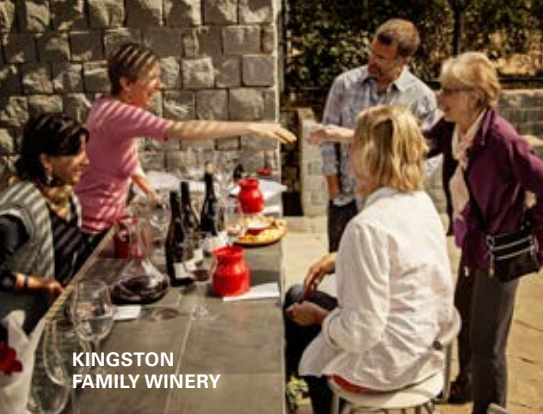
KINGSTON FAMILY WINERY