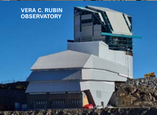
VERA C. RUBIN OBSERVATORY