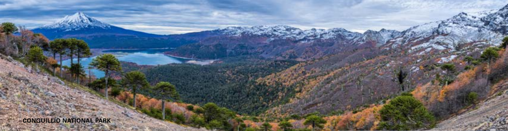
CONGUILLÍO NATIONAL PARK