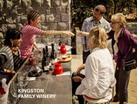
KINGSTON FAMILY WINERY