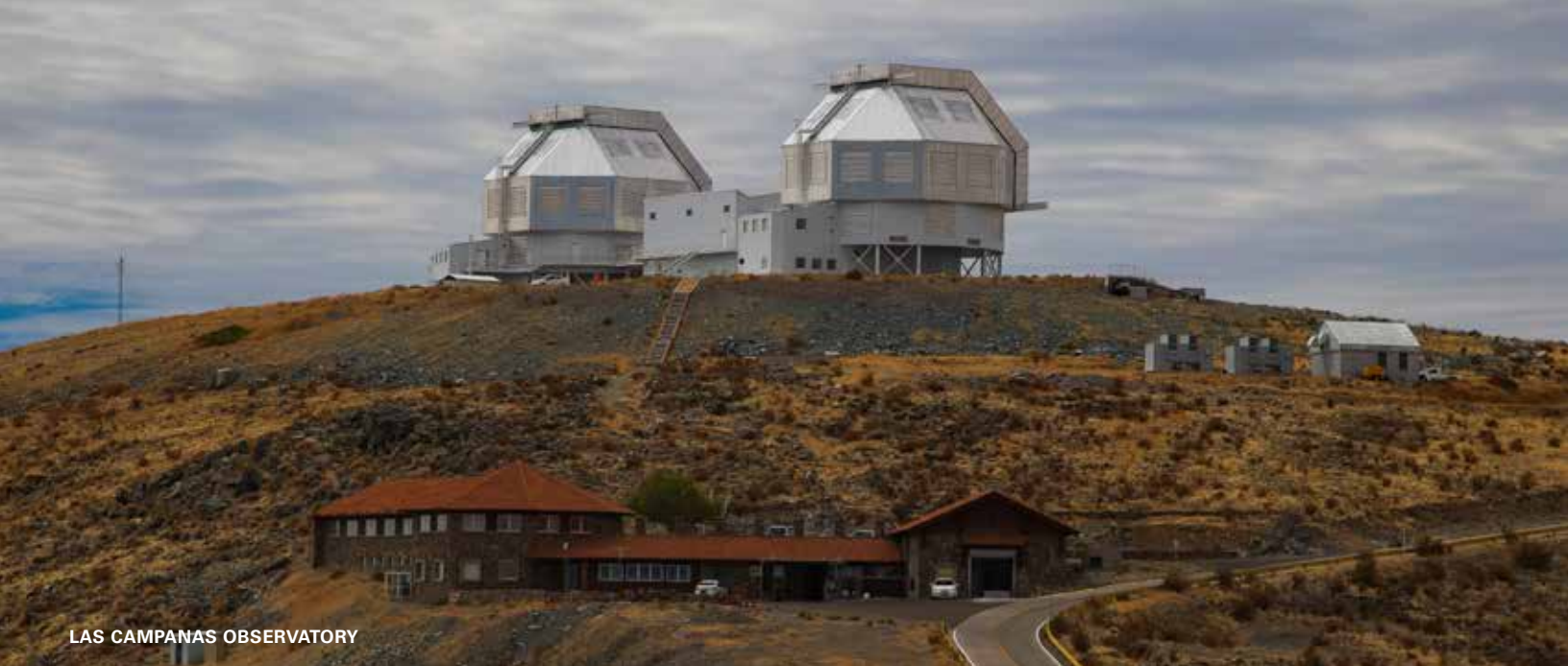
LAS CAMPANAS OBSERVATORY