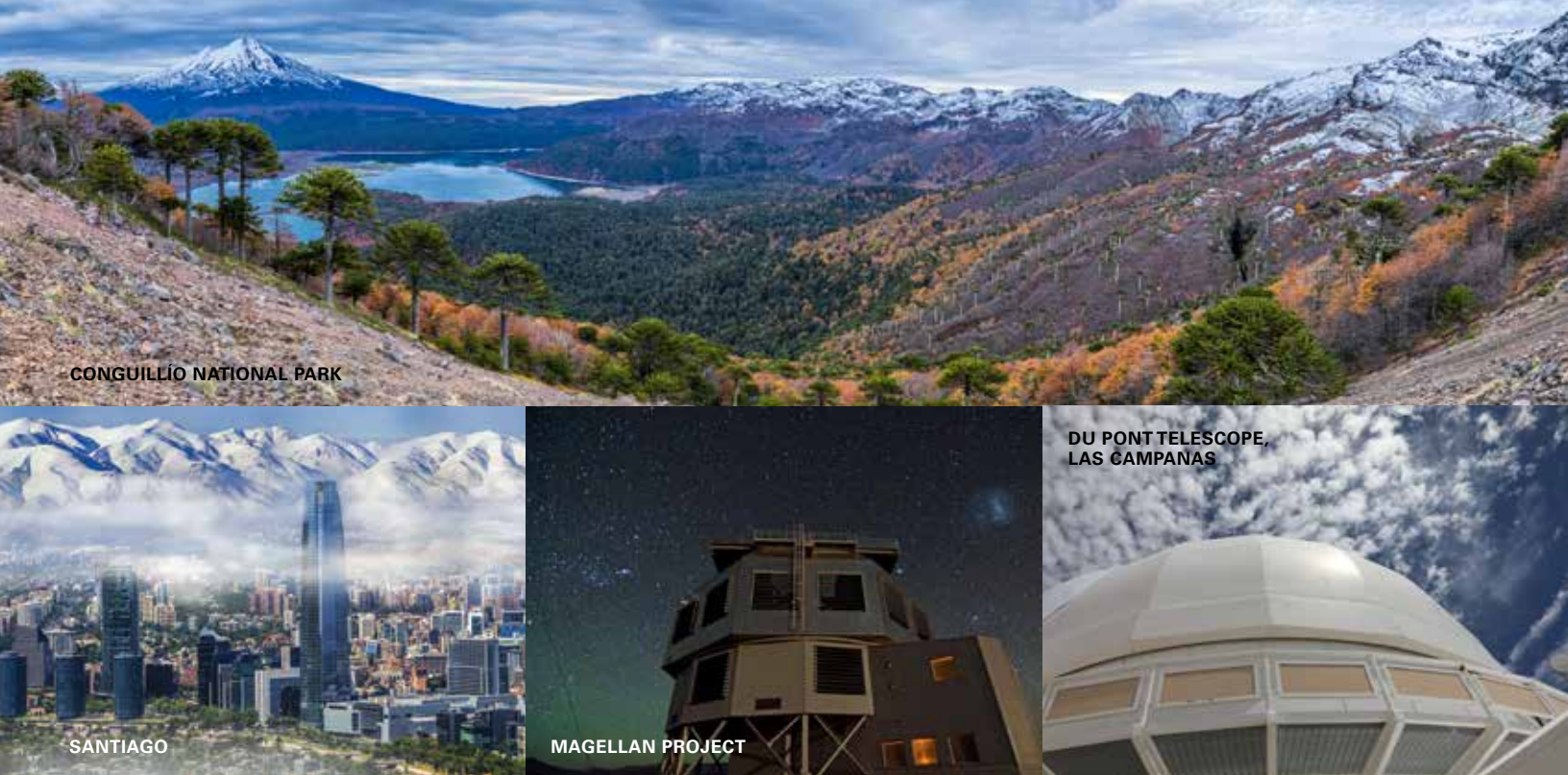
CONGUILLÍO NATIONAL PARK