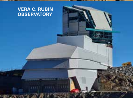
VERA C. RUBIN OBSERVATORY