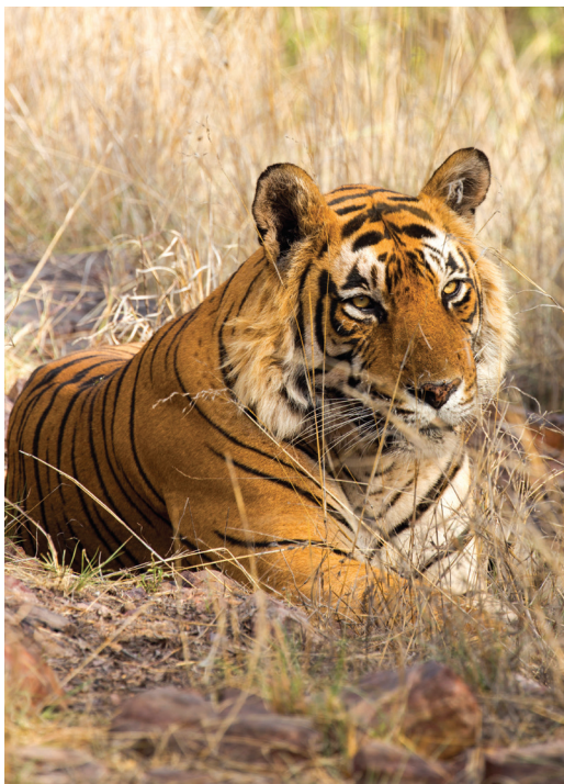
Bengal tiger rests in Ranthambore.

Day 16: Varanasi/Delhi We fly this afternoon to Delhi, where the evening is at leisure. B