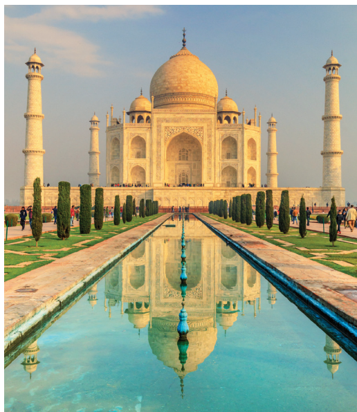
On Day 12 we visit the Taj Mahal , a UNESCO site.

Day 15: Varanasi Early this morning we return to the Ganges where Hindu pilgrims perform their rituals along the ghats (steps) leading to the river. We visit several ghats by boat as we experience for ourselves the spiritual aura of the hallowed Ganges waters. Then we return to our hotel with time to rest before this afternoon’s walking tour and private performance of classical sitar. Tonight we celebrate our journey at a farewell dinner at our hotel. B,D