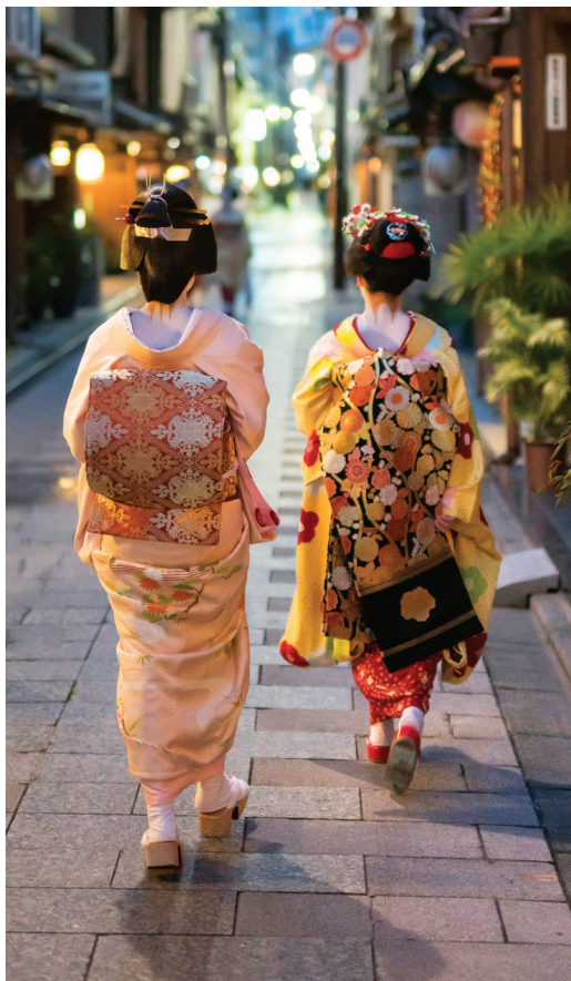
Geishas in traditional dress