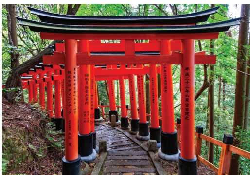
We visit Kyoto's Fushimi Inari shrine on Day 12.

Day 13: Depart Kyoto for U.S. We say sayonara to Japan as we depart from Osaka on our return flights to the United States. B