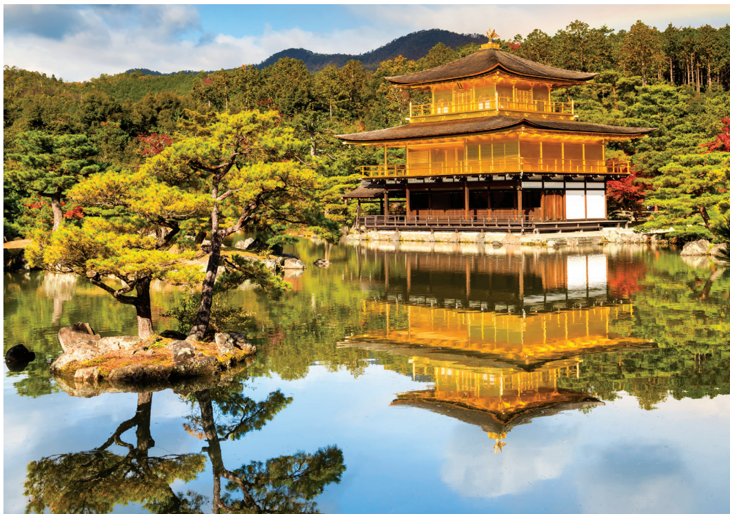
We visit Kyoto's Temple of the Golden Pavilion on Day 11.

Day 6: Hakone/Takayama Today, we travel first by bullet train then by Wide View Hida express train to lovely Takayama in the Japanese Alps, considered one of the country's most attractive towns with its beautifully preserved Old Town. Our explorations center on three narrow streets in the San-machi-suji district where, in feudal times, merchants lived amidst the authentically preserved small inns, teahouses, and sake breweries. This afternoon, we attend a traditional Japanese tea ceremony, an historic ritual of form, grace, and spirituality. B,D